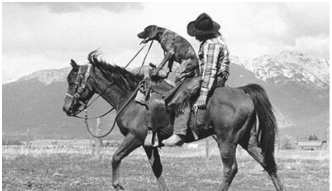
Wyoming designated driver